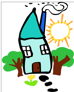
The new Pigsty??!